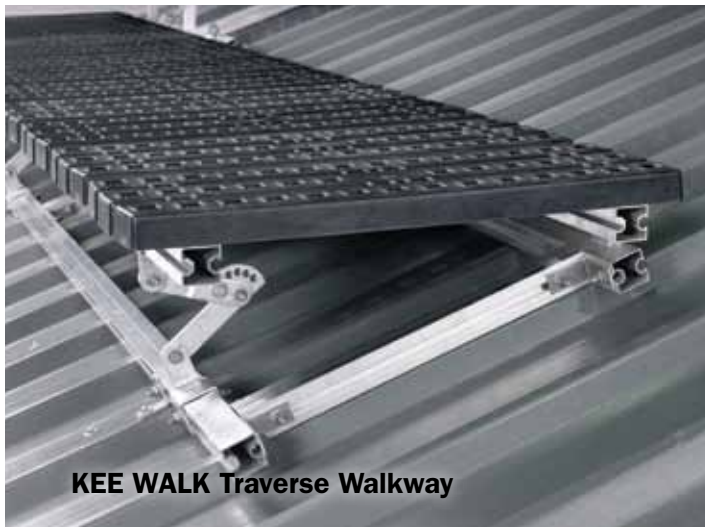
KEE WALK Traverse Walkway

Supplied pre-assembled by Kee Safety to facilitate rapid on-site installation and thus minimise installation costs, these standard lengths have 12 treads per 3m. Weighing only 24kg, the standard lengths are easily positioned and aligned. They are joined together by a simple 100mm long straight connector which attaches to the bearer bars.