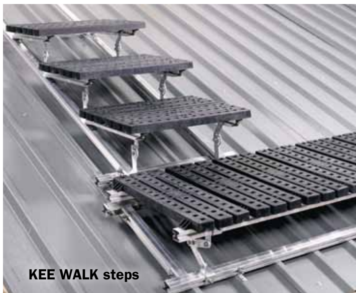
KEE WALK steps

Kee Systems provides pre-assembled step configurations in 3m or 1.5m lengths which require only minor adjustment on-site. The rotating arms (shown above) allow the installer to set the angle of the steps simply by removing the locating bolt, setting the horizontal angle and then replacing the bolt. The steps configurations will change depending on the pitch of the roof. Standard components are available for 5° - 10°, 10° - 15°, 15° - 25°, 25° - 35°, all which comply with the requirements of EN 516. Kee Systems can provide specific information on all the different step configurations as required.